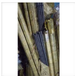
MILD STEEL TIE ROD

Double Drum Ride On Roller, HGS40B Bar Threading Machine, High Frequency Needle Vibrator, High Mast Pole, Metal Beam Crash Barrier, Mild Steel Tie Rod, NIRF001 Bus Shelter, NIRF002 Bus Shelter, NIRF003 Bus Shelter, NIRF004 Bus Shelter, NIRF005 Bus Shelter, NIRF006 Bus Shelter, NIRF007 Bus Shelter, NIRF008 Bus Shelter, Octagonal Pole, etc.