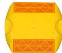
SM100 Plastic Road Stud