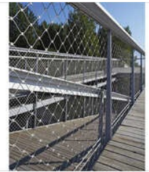
Wire Ropes Safety Fence