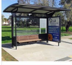
NIRF006 Bus Shelter