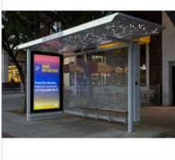
NIRF005 Bus Shelter