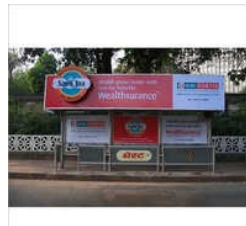
NIRF003 Bus Shelter