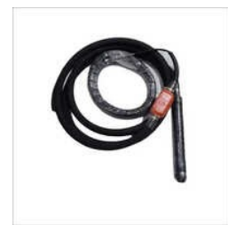
HIGH FREQUENCY NEEDLE VIBRATOR