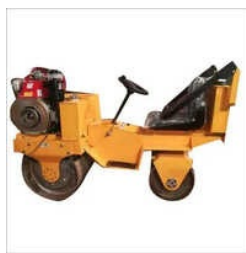
DOUBLE DRUM RIDE ON ROLLER