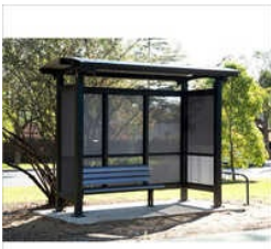
NIRF001 Bus Shelter