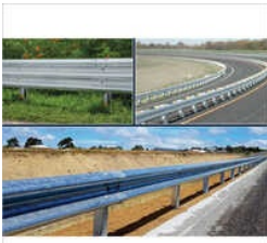
Metal Beam Crash Barrier