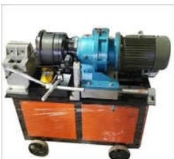
HGS40B Bar Threading Machine