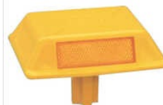
SM101 Plastic Road Stud