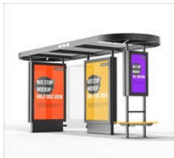
NIRF002 Bus Shelter