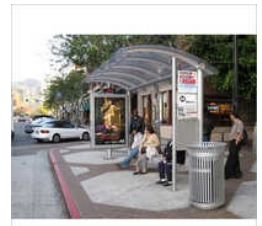
NIRF004 Bus Shelter