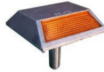
SM123 Aluminium Road Stud