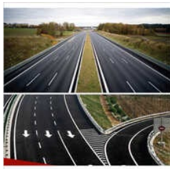
Road Marking System