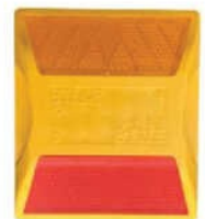
SM103 Safety Road Stud